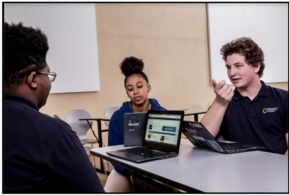
"Everyday Use" by Alice Walker (9th Grade)